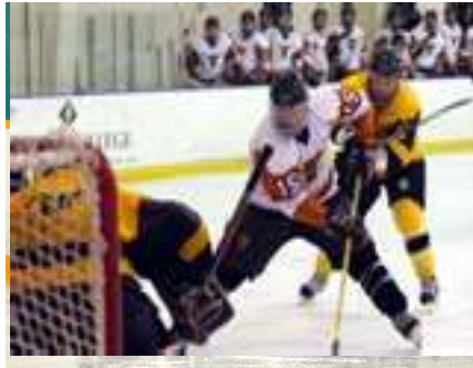
Teams from different regions will participate at the KAHC

We are highly confident that KAHC will continue to grow and develop into one of the most prestigious adult hockey tournaments in North America. With your help, KAHC will be able to flourish and generate positive benefits for Kingston's business community.